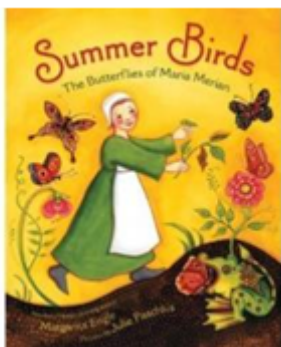
In the 17th century, butterflies were evil.